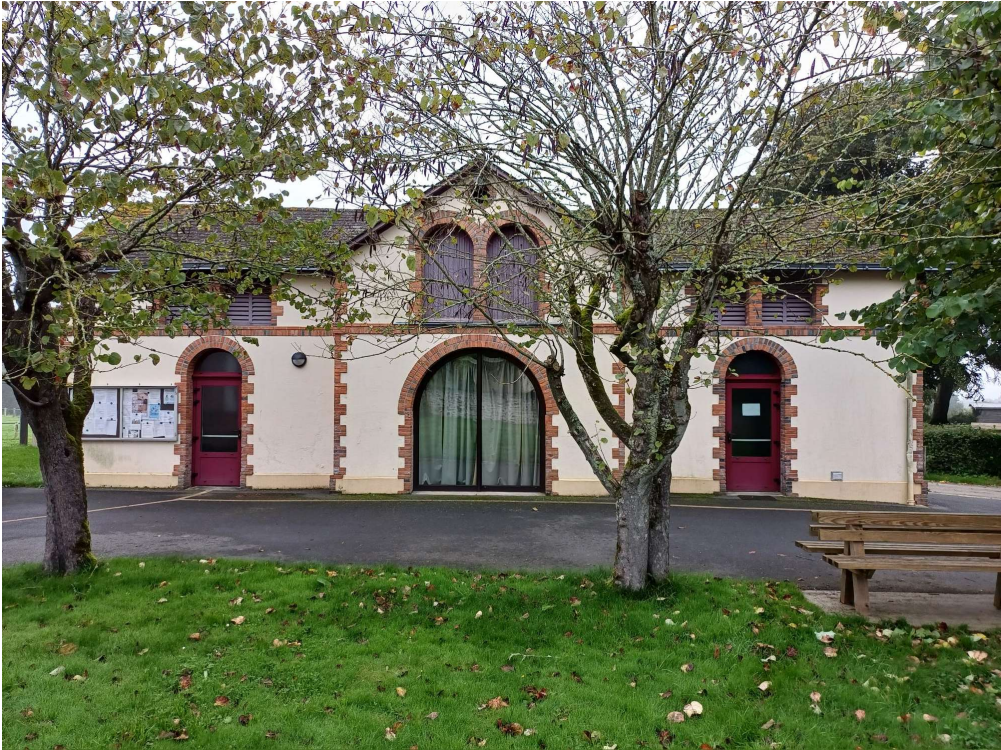
PCMI 7 - Photo proche