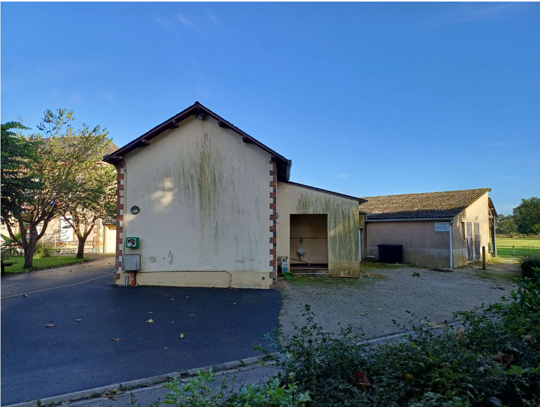
PCMI 7 - Photo proche